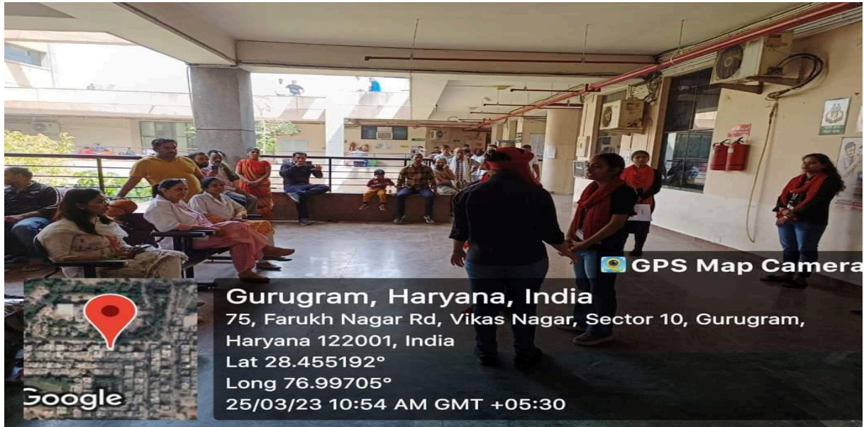
GNM Nursing Students Talk about the Girls equity and education

SHREE GURU GOBIND SINGH TRICENTENARY UNIVERSITY (UGC & AICTE Approved) Gurugram, Delhi-NCR