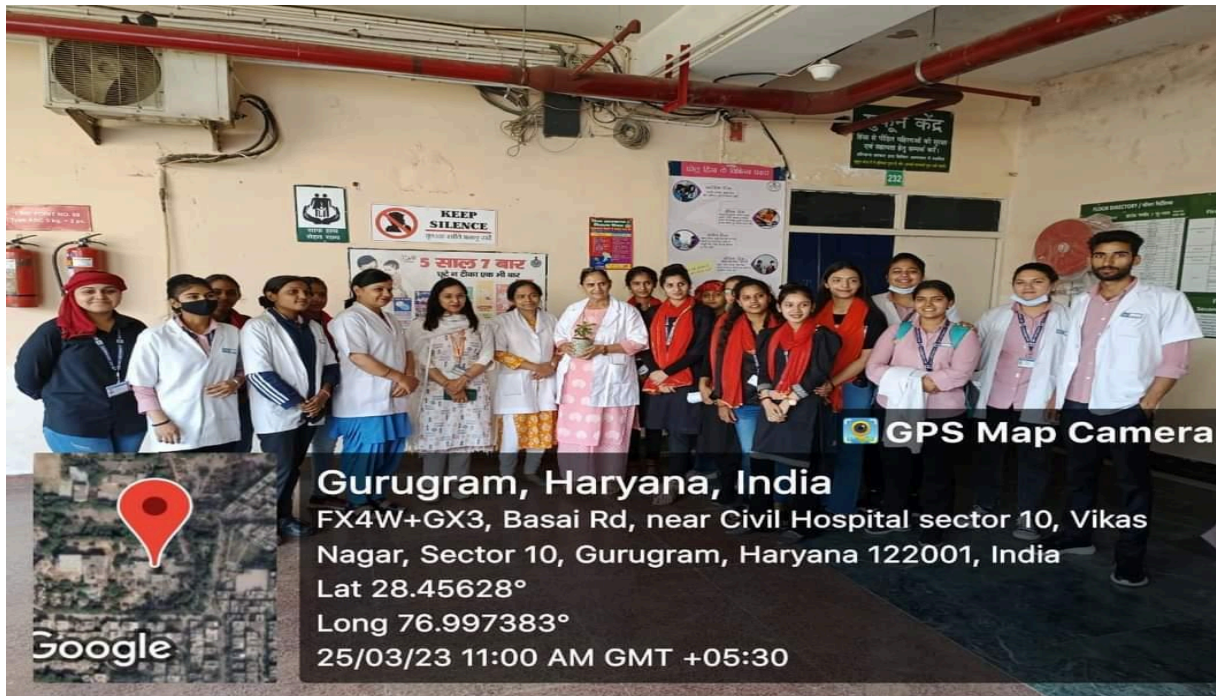
Felicitation to Metron, Civil Hospital